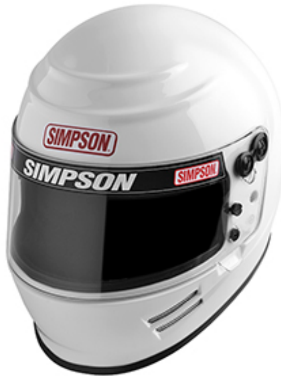
Snell SA 2015 Voyager 2 Helmet